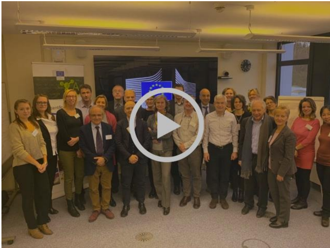
VIGOUR project kick-off video

With the help of the experiences gained from the VIGOUR regions, evidence-based guidance material will be made publicly available at a later stage. Also, check out the VIGOUR website for alerts on scaling-up guidance webinars to be held towards the end of the project.