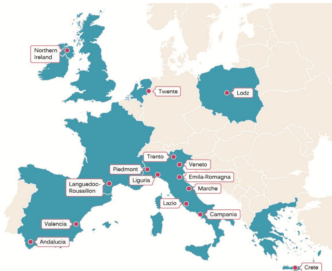
The 15 VIGOUR regions