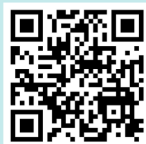
Website QR Code