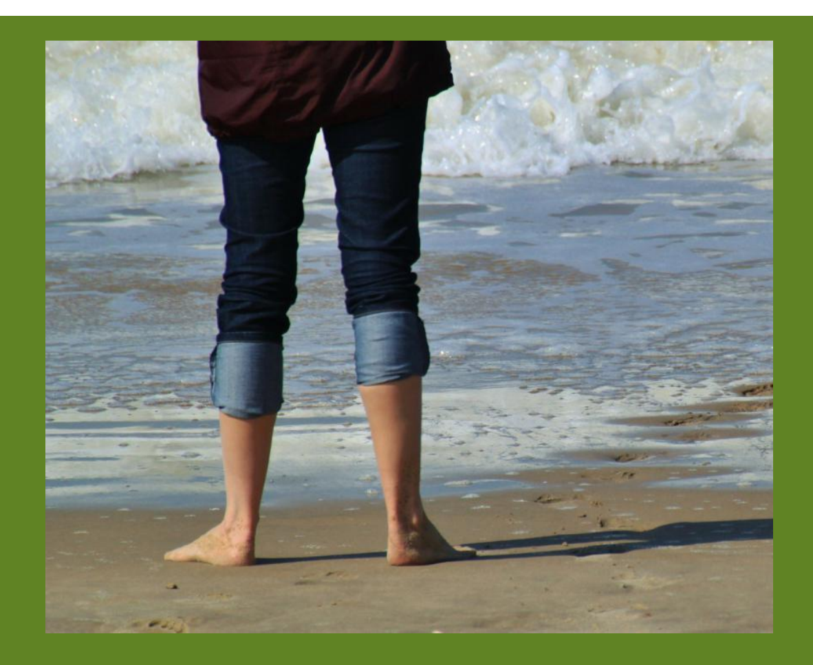
Anxiety, Depression and Autism (ASD) Conference, 24th November 2017, UK

Conference exploring psychological interventions for children and young people with Anxiety, Depression and Autism (ASD) Conference