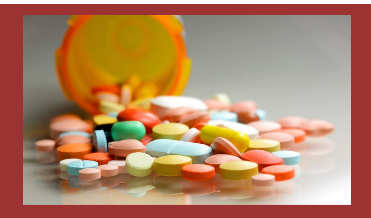
HiAP 2018, A Strategy for Improving Population Health, 6th of February 2018 – RSM, London

Health in All Policies (HiAP) is an approach to policies that systematically and explicitly takes into account the health implications of the decisions we make; targets the key social determinants of health; looks for synergies between health and other core objectives and the work we do with partners; and tries to avoid causing harm with the aim of improving the health of the population and reducing inequity.