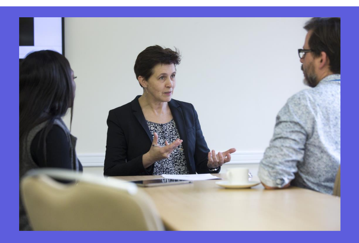
Building your authority: influencing beyond your role. 1st-5th October 2018,

Now, more than ever before, leaders at all levels need to be able to work more collaboratively and to influence beyond their formal reporting lines. They also need to be able to work with colleagues – both senior and junior – from different professional backgrounds and organisations. Building Your Authority is a five-day programme that aims to equip you with tools and strategies that will enable you to influence beyond your role and build your capability to work effectively within groups and across systems.