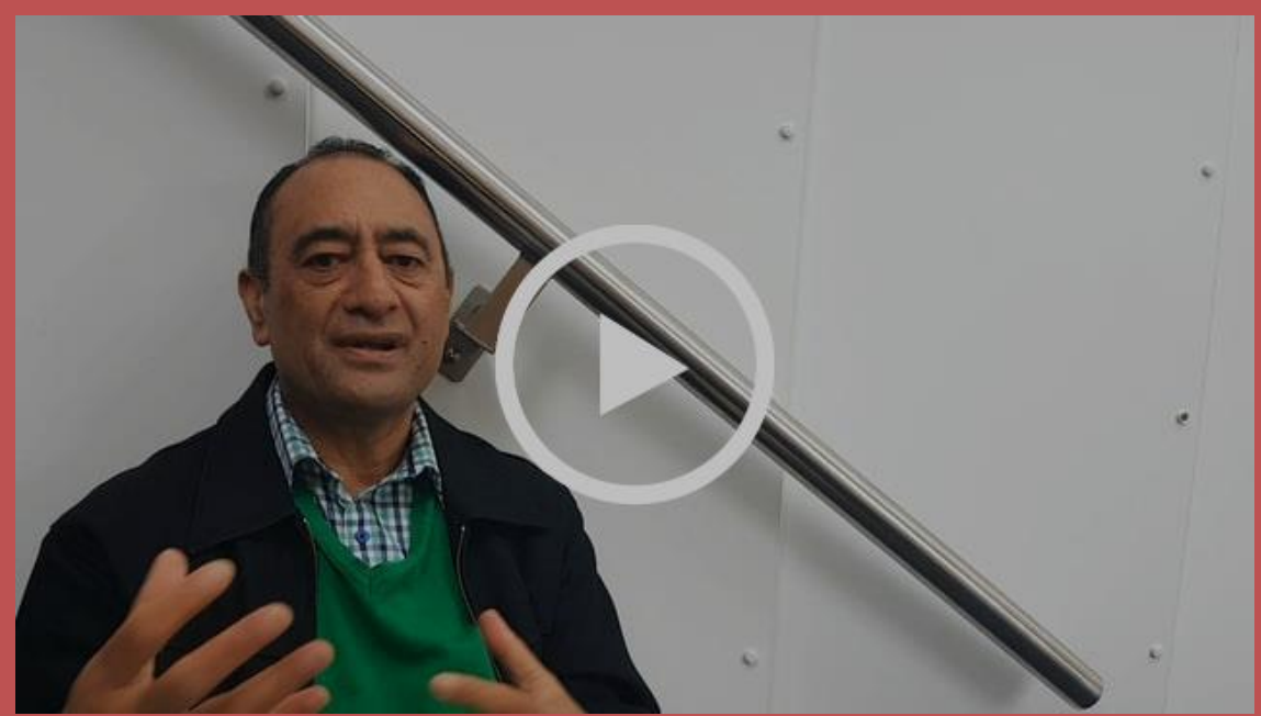
Transforming the Landscape of Healthcare | Ohomairangi te Hauora Manaaki

The Maori translation & meaning of our conference theme is explained in the video below.