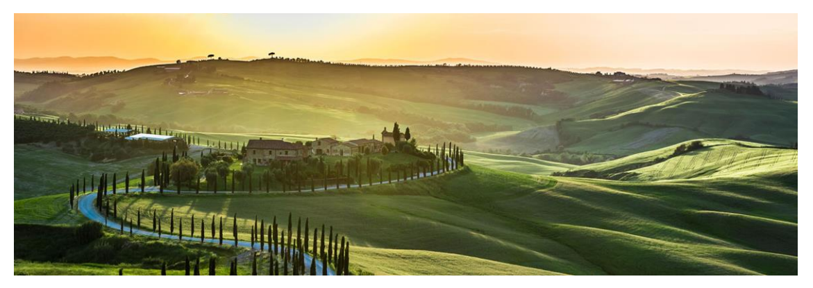
The International Association for Risk Management in Medicine

The number of participants is limited. Please make your arrangements soon. All information is available on www.eipen.eu