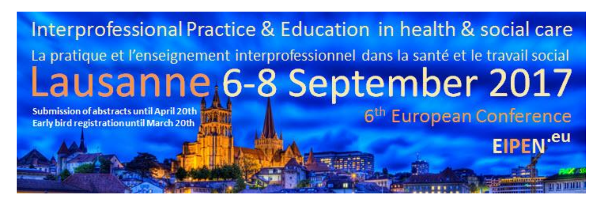
EIPEN Conference 2017

The 6th European conference on interprofessional practice and education is held in Lausanne, Switzerland. The call for submission of abstracts/proposals is open until April 20th.