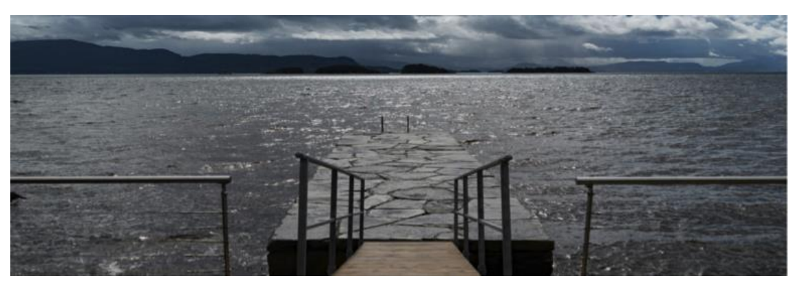
Nordic Interprofessional Network (NIPNET) Conference: 8-9 June, Bergen, Norway.

The new Western Norway University of Applied Sciences (formally established by 1.1.2017!) will be hosting the NIPNET- conference 2017, in collaboration with the Norwegian IPE- network.