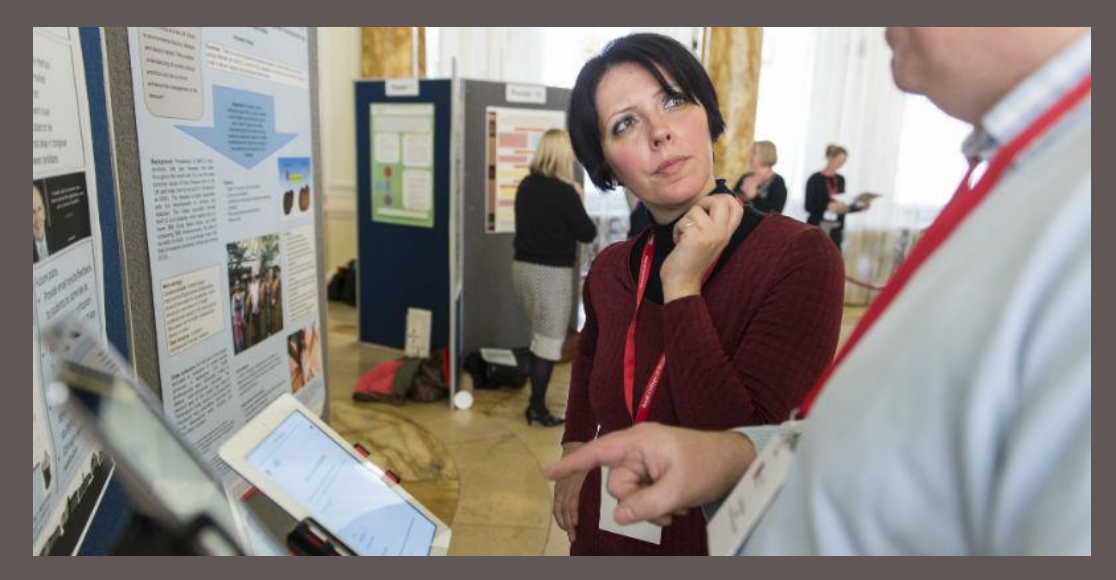
Call for Abstracts - Leadership in nursing education: facing challenges, creating opportunities, RCN Education Forum National Conference & exhibition